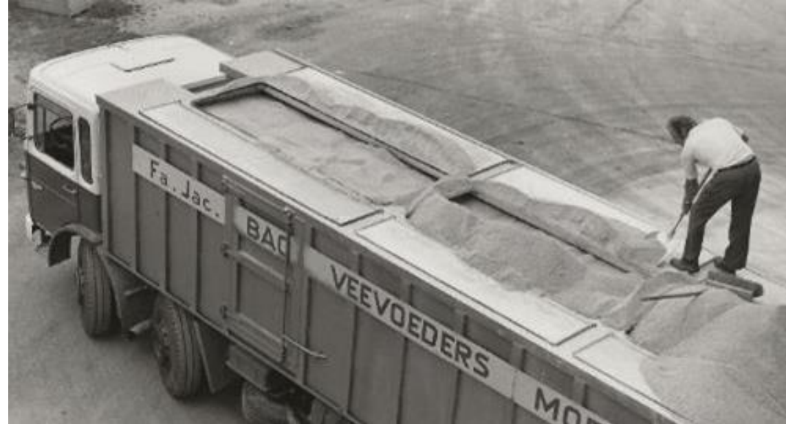
Europe – since 1960