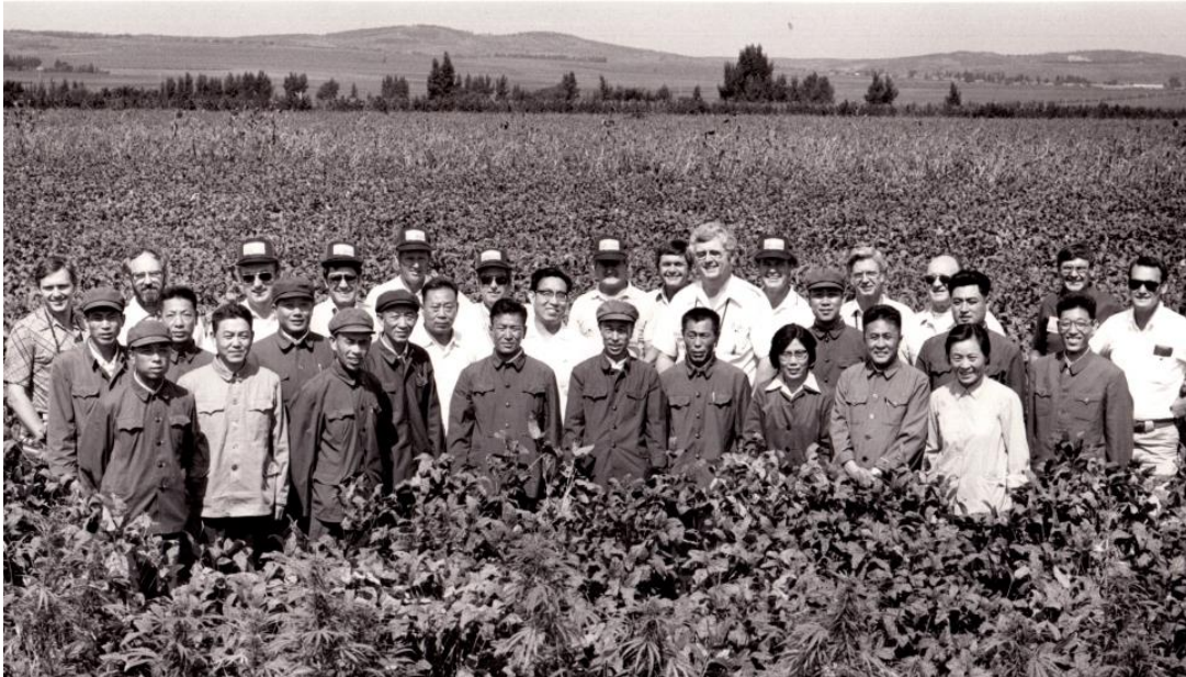
China – since 1982