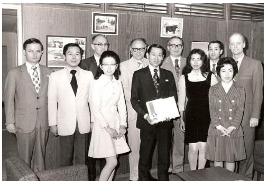
Japan – since 1956